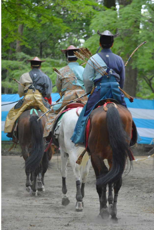
*This photo is an image only.

*Please kindly send us the link and/or details if you publish any articles on your media based on this information. Email: tokyo@jcinteractive.ca