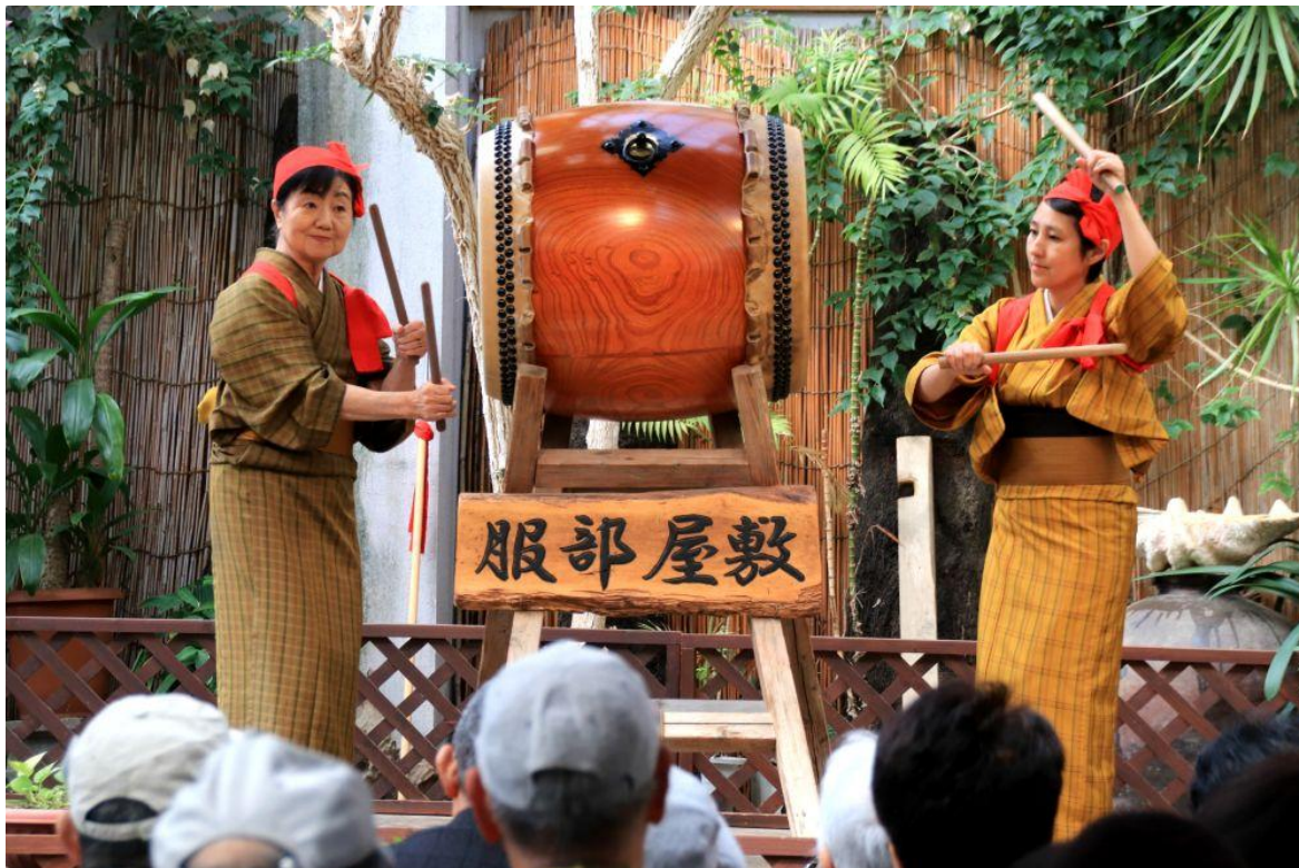
Hachijojima Taiko Drumming performance

The sashimi at Zakoya Kiyomaru is fresh and delicious, as are the taiyaki, the fish-shaped, red bean paste cakes at Tokyo Voneten.