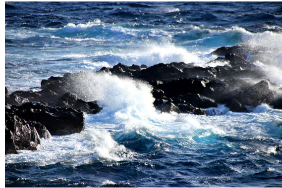
(From left) Miyakejima--Wild Pacific Ocean water views

After savouring the seafood at Ikeyoshi Restaurant, taste the wheat-based shochu at Miyakejima Shuzo.