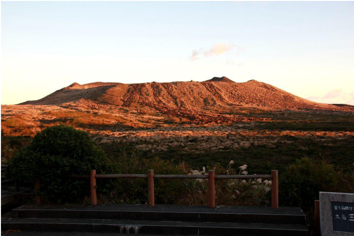
Mt. Mihara on Oshima

While there is plenty of adventure in Metropolitan Tokyo, those seeking a different type of getaway can indulge in gorgeous scenery, black (and white) sand beaches, volcanic craters, nature, aquatic sports, gastronomy, shochu, and super-friendly people.