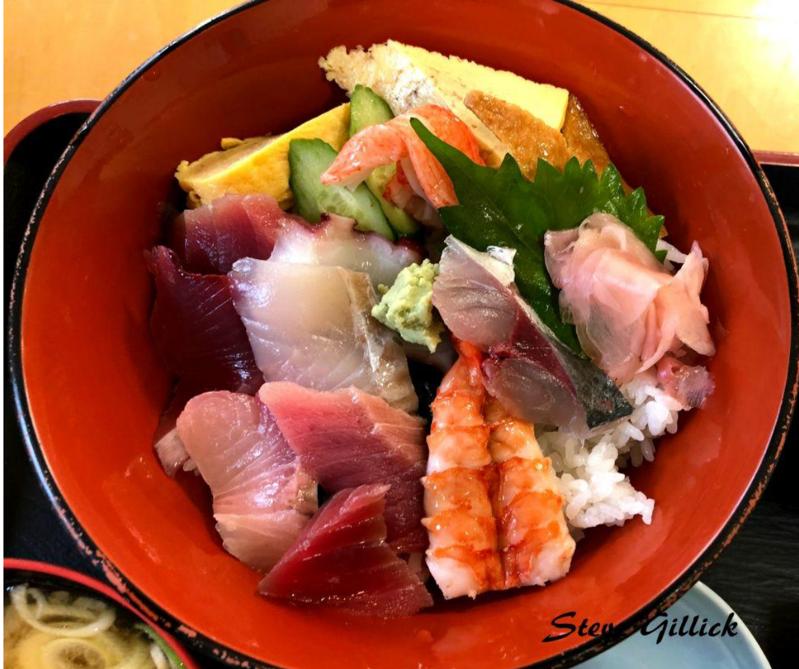
Chirashi sushi lunch at Ikeyoshi in Miyakejima

Miyakejima is a 55-minute flight from Tokyo's Chofu Airport. Spring is a birders' paradise; summer is prime for swimming, fishing, and coral reef diving. Winter activities include trekking and ocean fishing. Taiko drumming, surfing, biking, and seasonal festivals add to the island's appeal.