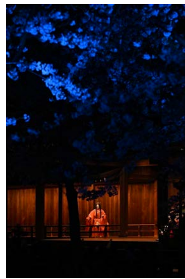
Yozakura Noh