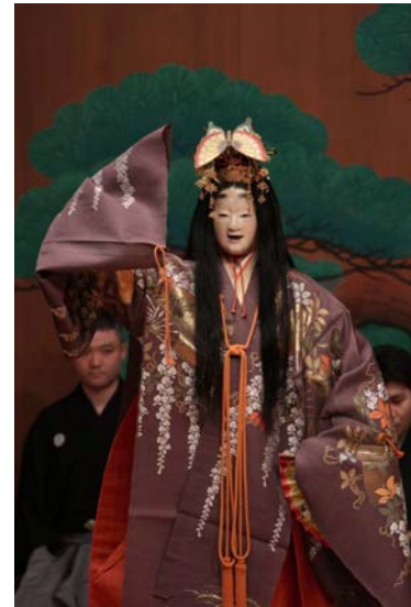
Hosho School master performing Kocho

Contact for tickets, media inquiries, and limited-availability private events: contact@my-taiken.com